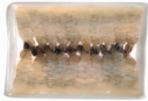
Mirabel Nobashi Ebi (raw)